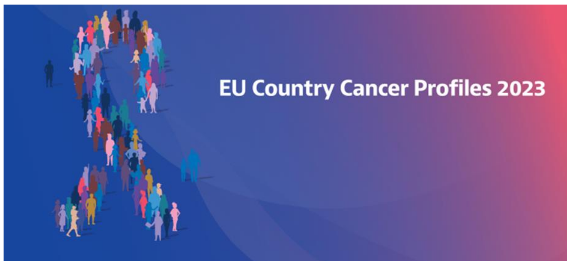
Front cover of EU Country Cancer Profiles 2023.

The first Country Cancer Profiles under the European Cancer Inequalities Registry state significant inequalities in cancer mortality rates between and within EU member states. These reports reveal that varying exposure to risk factors for cancer and the different capacity of healthcare systems to provide timely and free access to early diagnosis , as well as high-quality cancer care and treatment, partly explain these inequalities .