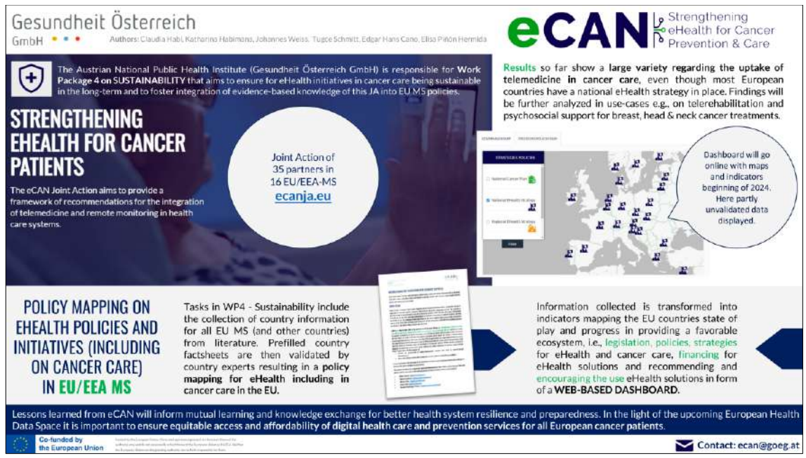
European Public Health Conference poster of Work Package 4

The WP4 poster also includes contributions from members of WP1 (Coordination) and WP2. By collecting data from EU/EEA Member States, the Sustainability WP aims to provide an overview of European eHealth policies and initiatives with a focus on cancer . The project website will display the validated information in a dashboard with maps and indicators during next year.