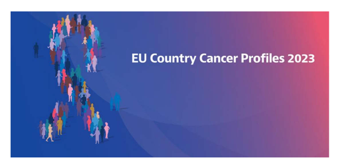
Front cover of EU Country Cancer Profiles 2023. / OECD, European Commission

The first <u>Country Cancer Profiles</u> under the European Cancer Inequalities Registry state significant inequalities in cancer mortality rates between and within EU member states. These reports reveal that varying exposure to risk factors for cancer and the different capacity of healthcare systems to provide timely and free access to early diagnosis, as well as high-quality cancer care and treatment, partly explain these inequalities.